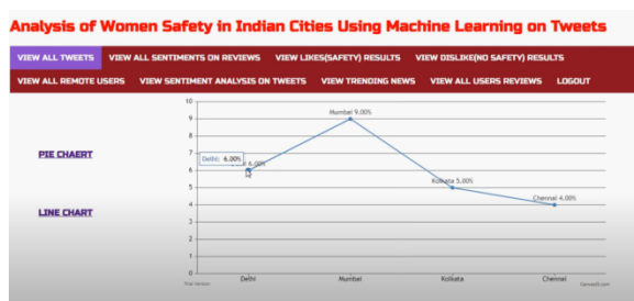
Figure 2 ADMIN LOGIN ANALYSIS