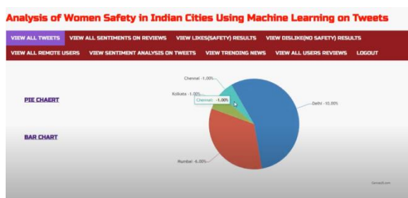
Figure 3 PIE GRAPH