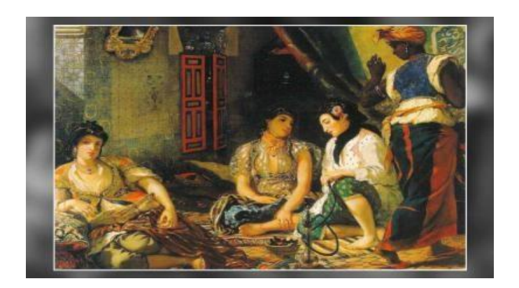
Algerian women painting