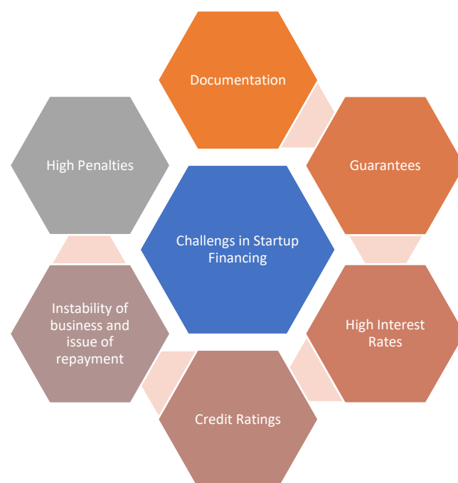
Figure 2 Challenges in Startup Financing