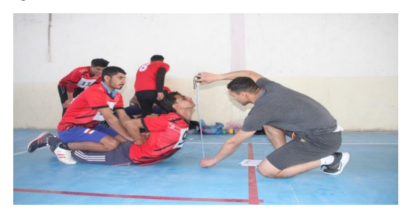
Figure (1). The stem bending test shows a successor to measure the rear elasticity of the spine.

Registration: Each laboratory has two attempts to record their best attempt, as illustrated in figure (1).