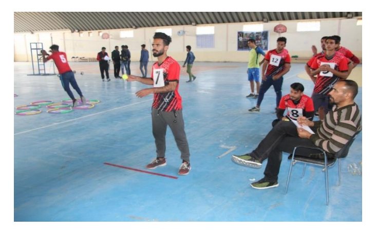
Figure (3). The ball throw and receiver test shows the wall to measure the eye-arm harmony

Registration: Each correct attempt is calculated at the level of the laboratory and the final score of 15 degrees. As shown in figure (3).