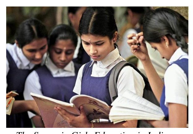
The Scenario Girls Education in India