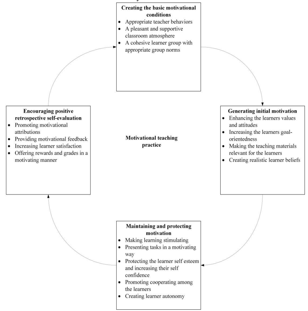
Figure 2: Motivational teaching practise

providing the students plenty of practise time, the framework's strategies—which also arose from the information learner collaboration and boosted their self-confidence.