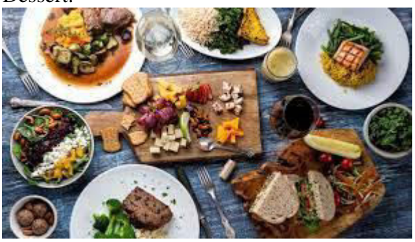
Figure 1. Appetizer, Soup, Main Course, Dessert.

materials, soup and sauce. Continental food is a food that comes from a country that has a wide plain that is Europe, America and Australia consisting of Appetizer, Soup, Main Course, Dessert.