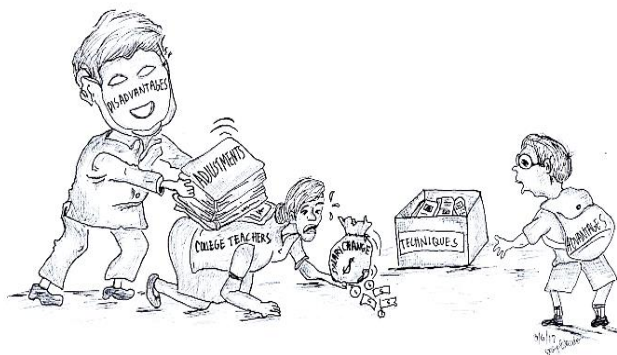
Figure 2. The Simulacrum of the Study

The illustration symbolizes the lived experiences of teachers in the new teaching environment. The one who is suffering represents the college teachers. They suffer and risk their profession as a professor when they became a senior high school teacher. Similarly, the teacher is reaching the box which represents techniques for them to help their students to manage their behavior and to widen the understandings of their students. On the other hand, the one who's wearing a mask represents the disadvantages and the challenges of implementing this curriculum in our country, it gives the teachers a lot of work and all the adjustments that the teachers will apply to teach the students effectively. Likewise, the salary that they get when they were in college is not the same as before, because of the new curriculum, they receive a salary that they don't deserve as a senior high school teacher because they feel dissatisfied about it. The student who has a bag represents the advantages of the k-12 curriculum. He helps the teacher to get up and to realize that this curriculum has a good impact on our country and to everyone.