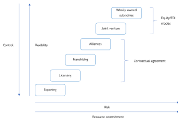
Figure 1: Arrangement of entry modes form (Cavusgil, 2009)

Cavusgil (2009) has arranged market entry mode into four dimensions: control, risk, resource commitment and flexibility. Nonetheless, all these four extents are connecting to each other. In the extent of resource commitment, newcomers obtain a higher control degree over their operation in foreign market. At the same time, firms committing more resources will narrow down their flexibility and increasing more risk. In addition, foreign direct investment (FDI) involves equity investments which are wholly owned subsidiaries (WOSs) and joint ventures (JVs). Meanwhile, acquisition mode involves the foundation of a physical existence in foreign countries through possession of productive assets such as labor, capital, technology or factory (Cavusgil, 2009). Furthermore, contractual arrangements involve non-equity investment which are licensing, franchising and alliances (Pan & David, 2000).