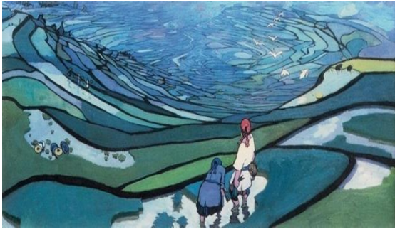
Figure1: Longji terrace, Huangjing creation