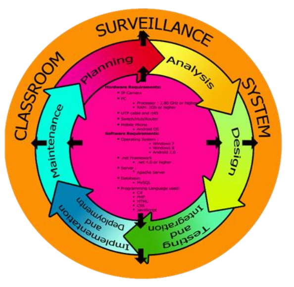
Figure 1. Schema of the System

In this project, classroom surveillance system is proposed in order to provide users with information termed as confidence information. This information is the extent to which the system is certain about its choice. Classroom surveillance system is prototyped which tests varying levels of functionality, reliability, usability, efficiency. maintainability, and accuracy. The schema of the study is presented in Figure 1 which involves three (3) important stages, namely: requirements in putting up a Classroom Surveillance System, system development life cycle, and the output of the system design. The innermost circle contains hardware and software components of the system, The hardware requirement includes namely computers, IP Camera , UTP cable and rj45, router, mobile phone while the software requirements include Operating System, Apache Server, MySQL for the Database, Programming Language used are C#, PHP, HTML, CSS and JavaScript.