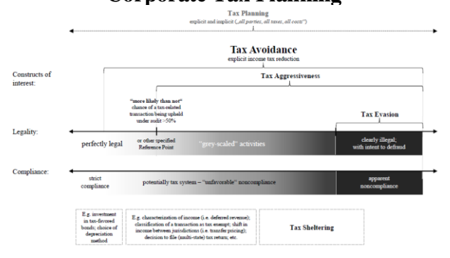
Figure 2 : Unifying Conceptual Framework of Corporate Tax Planning

Lietz (2013) develops and illustrates a conceptual framework to promote a shared understanding of corporate tax planning construction. Lietz (2013) says that the use of improper tax planning constructions and different readings can increase the risk that opinion-making bodies and regulators falsely convey the impression that any type of tax planning that is direct to the explicit tax reduction is illegal or at least has a connotation of doubt moral