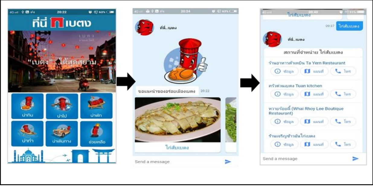
Figure 2 An example of artificial intelligence for being a good host.

The users can type text or input audio text in order to allow the system to process and answer questions on demand or select data via the menu that has been defined as above. The system will send data to the API to process questions and connect to a database containing various tables such as food tables, restaurant tables, activity schedules, etc. After that, the system answers questions and displays results in the form of text, images, maps, phone numbers through the chatbot as postbox-shaped, which is the symbol of Betong District. The researcher illustrated the structure of the artificial intelligence response system for being a good host, a case study of the city of tourism, Betong District, Yala Province as following;