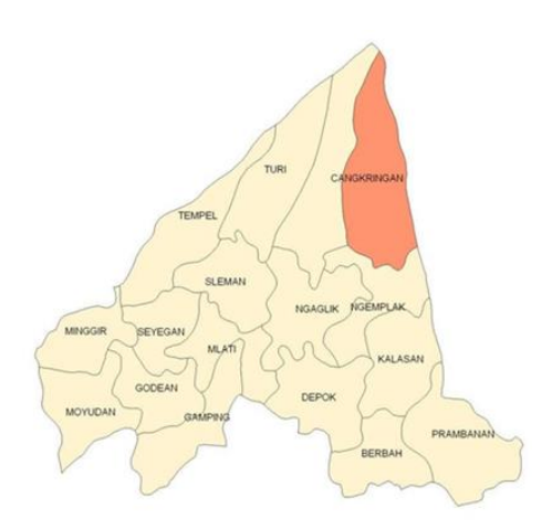
Figure 1. Cangkringan Area Map

Cangkringan is distrct in Sleman regency of Yogyakarta. Cangkringan area has its attractiveness because it's place that drained with bigs rivers that produce many sand and rocks like Opak, Gendol, and Kuning rivers. Sand and rock in Cangkringan is from material of Merapi eruption so until nowdays society has perception that Merapi eruption is a gift and not a threat. Geographic location of Cangkringan that has potential to produce sand and rocks so this area can develop as Industrial area (Permana, 2016; Permana, 2017; Eickelman, 1978; Glenn, 2013).