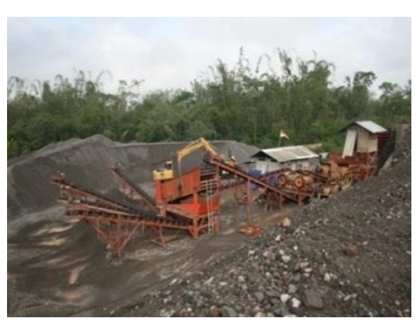
Figure 3. The Rocks Minning Place as Raw Material of Block Making in Umbulharjo, Cangkringan

Tour and as lobor of sand and rocks minning in dry season (Pyles, 2011).