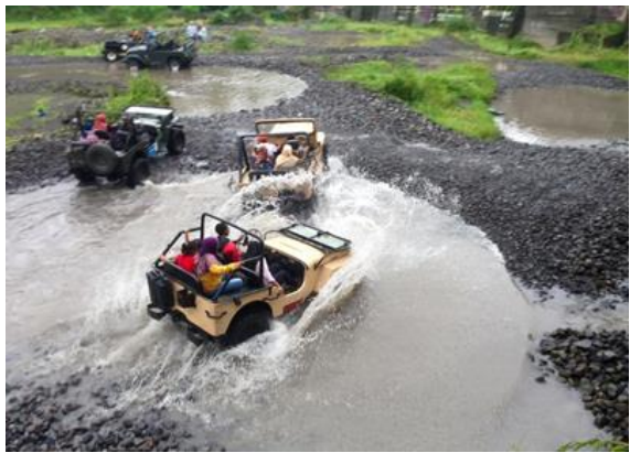
Figure 5. Business of Jeep Lava Tour Turism

Beside they becomes sand and rocks manner, they also become bredeer, especially dairy cow and beef cattle. Then, they also sale the milk that collected by local village cooperative (KUD) with price Rp. 2000,- per liter. In one day they can supply two times with the average in each supply is 5-10 liter per (Pyles, 2011; Sajogya, 1977; Setyowati, 2014).