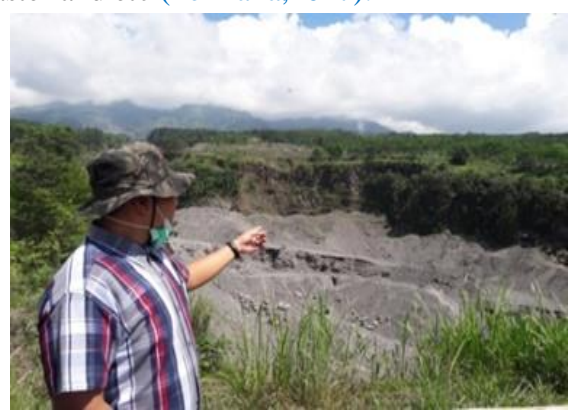
Figure 4. Parennial Sand Dunes in Desa Petung, Cangkringan

Local material availability in Cangkringan can fulfill the need of material for local society. This eruption materials then collected by society then they make it as block, mortar, and materials for plaster floor. Many of local material like big rock, small rock and sand are from Merapi eruption, collected by society as local material business whether in the raw form or mature form, like block, roaster and etc (Permana, 2017).