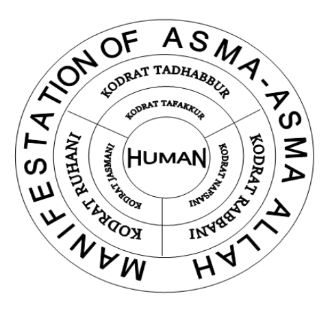
Figure The concept of "self" in humans

From the figure above, it can be seen that the essence of "self" in humans is the "manifestation of Allah's names", which is composed of both material and non-material natures, each of which has a relationship. For example, the nature of tafakkur is related to the nature of tadhabbur . Tafakkur is a form of work (process) of the reason that promotes rationality by placing philosophical justification as the only source of knowledge. Meanwhile, tadhabbur is the heart (spiritual) work, which places the source of the truth of empiricism (such as inspiration and revelation) as the only source of knowledge.